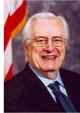
US Rep. Henry Hyde 1924-2007 Requiescat in Pace

On Saturday, December 8 , Feast of the Immaculate Conception, from 10 AM to 11 AM , concerned citizens will assemble in front of the county library at 35 East Browning Road to call attention to the presence of this facility in our community, and to voice opposition to this “non profit” organization (with a national net profit of $65M in 2005!) receiving rental space subsidized by the taxpayers of Camden County.